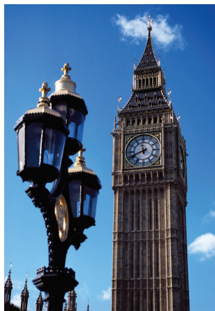
We see iconic Big Ben on Day 13.

site of British royalty’s Windsor Castle, where we have free time to explore on our own before we continue on to London, arriving late this afternoon. Dinner tonight is on our own in this cosmopolitan capital city. B