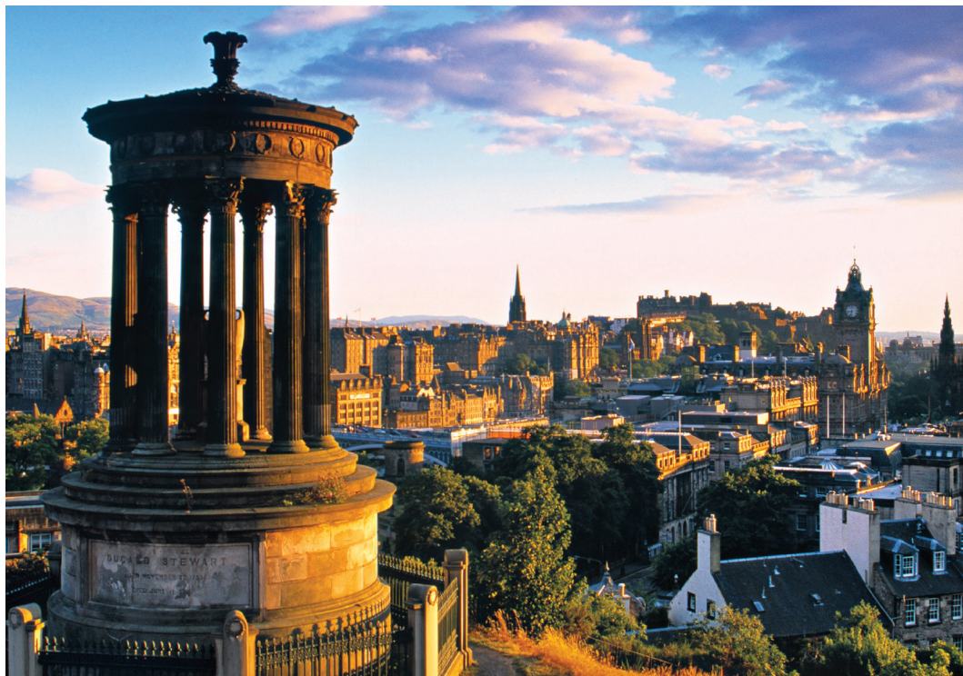
The Stewart Monument on Calton Hill overlooks Edinburgh.

Day 7: Lake District/North Wales Traveling through splendid Lake District scenery today, we reach Wales and stop at lovely Bodnant Garden, the historic 80-acre National Trust property. We continue on to the seaside town of Llandudno, dubbed “Queen of the Welsh Resorts,” and our hotel, where we dine tonight. B,D